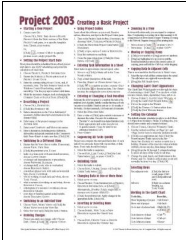
Filesize: 2.33 MB